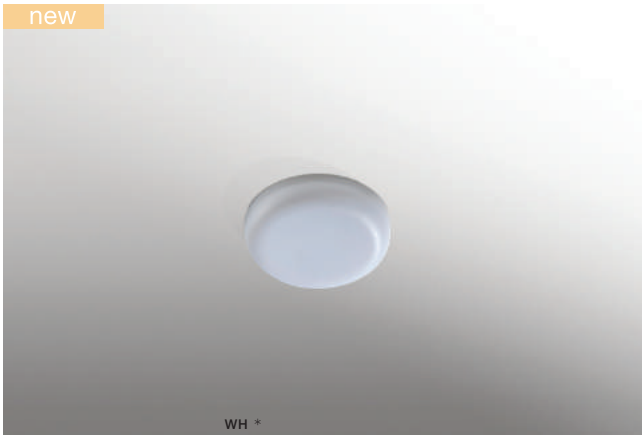
LAMIR R 9 IP44 3000K / 4000K