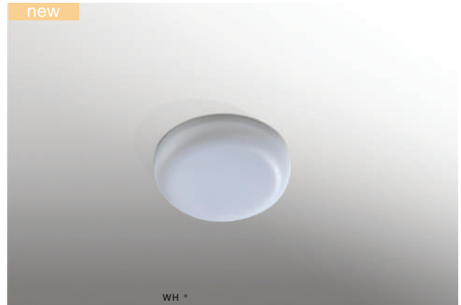
LAMIR R 12 IP44 3000K / 4000K