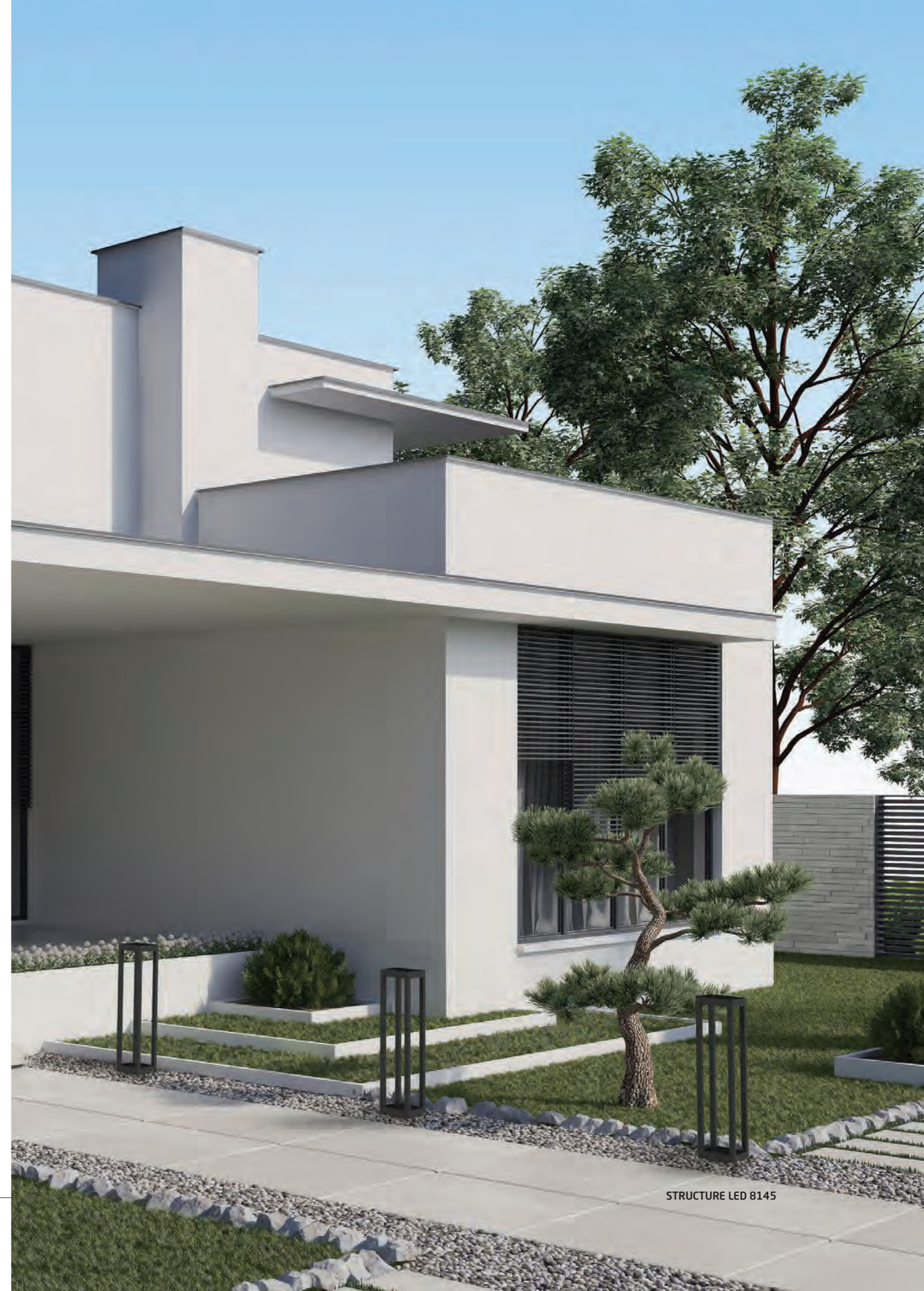
STRUCTURE LED 8145