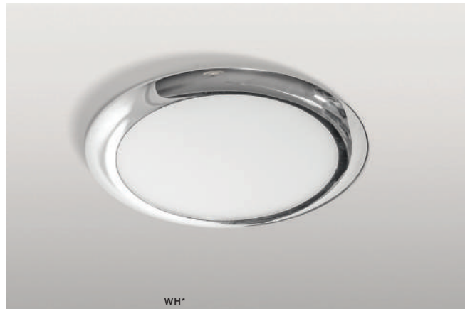
LINDA 30 3000K/4000K