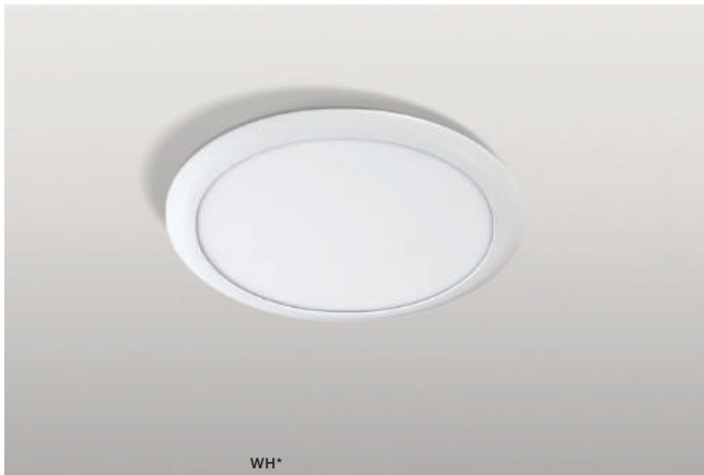
LINDA 23 3000K